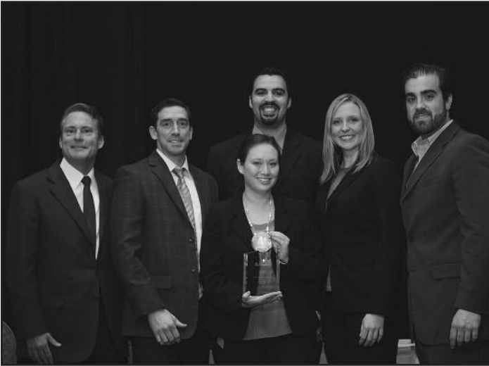
1st Place – Large Commercial Property 560 Mission managed by Hines