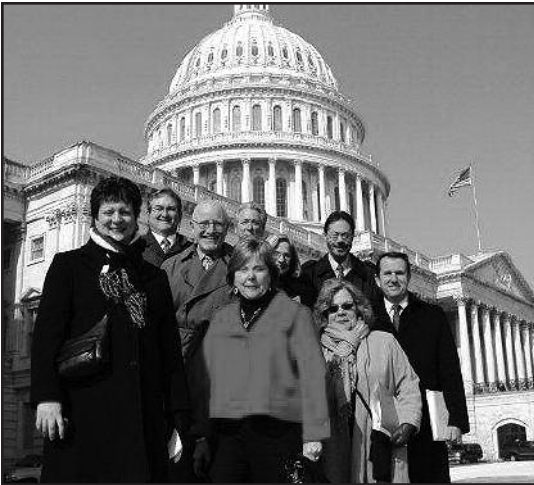
BOMA SF delegation on the steps of Capitol Building